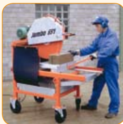
Heavy-duty frame with 4 wheels.