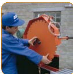
Easy access to the blade.